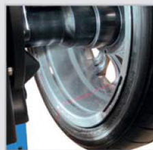
GAR322 (→ GP4.140R, G4.140R) Fixed laser