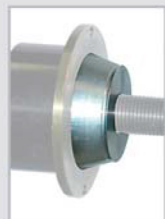
GAR112 (Ø 95-124mm) Off-road vehicles