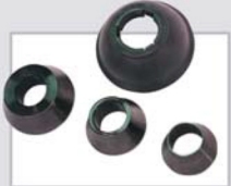
GAR111 (Ø 1.73" - 4.09") Car