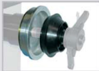
GAR 113 (Ø 4.64" - 6.85") Vans and light trucks