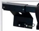
GAR315 (→ GAR 307)