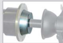
GAR 112 (Ø 3.74" - 4.88") Off-road vehicles