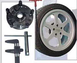
GAR131H Universal flange