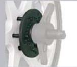
GAR132 Precision flange