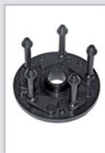
GAR 132 Precision flange