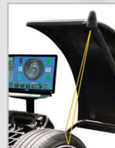
GAR334 LASERHEAD Internal and external laser blade shows precise 12 o'clock position in dynamic mode.