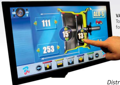
VARGM19TS Touch screen version for G4 SERIES