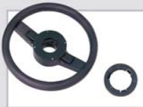
GAR102 Quick clamp for cars