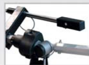
GAR316 (→ GAR 305) Ultrasound run out sensor