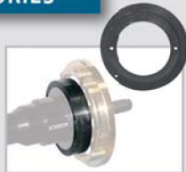
GAR124 Light Truck Cone & Spacer kit