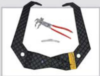
Plastic Caliper & Pliers