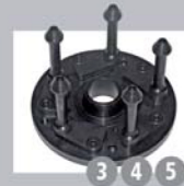
GAR133 (→ GAR132) Set of short stands